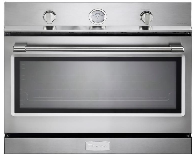
Stainless Steel: VEBIG30NSS