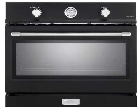
Matte Black: VEBIG30NE